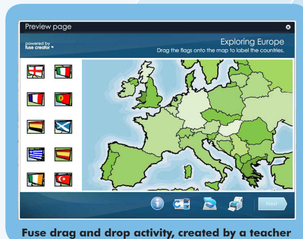
Fuse drag and drop activity, created by a teacher

Fuse Creator enables teachers and students, without design or programming skills, to create engaging, interactive digital activities for whiteboard or individual use. High quality activities are produced quickly and simply and can be used on PC or Mac computers, locally, on a school network or over the web.