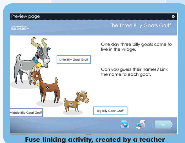
Fuse linking activity, created by a teacher